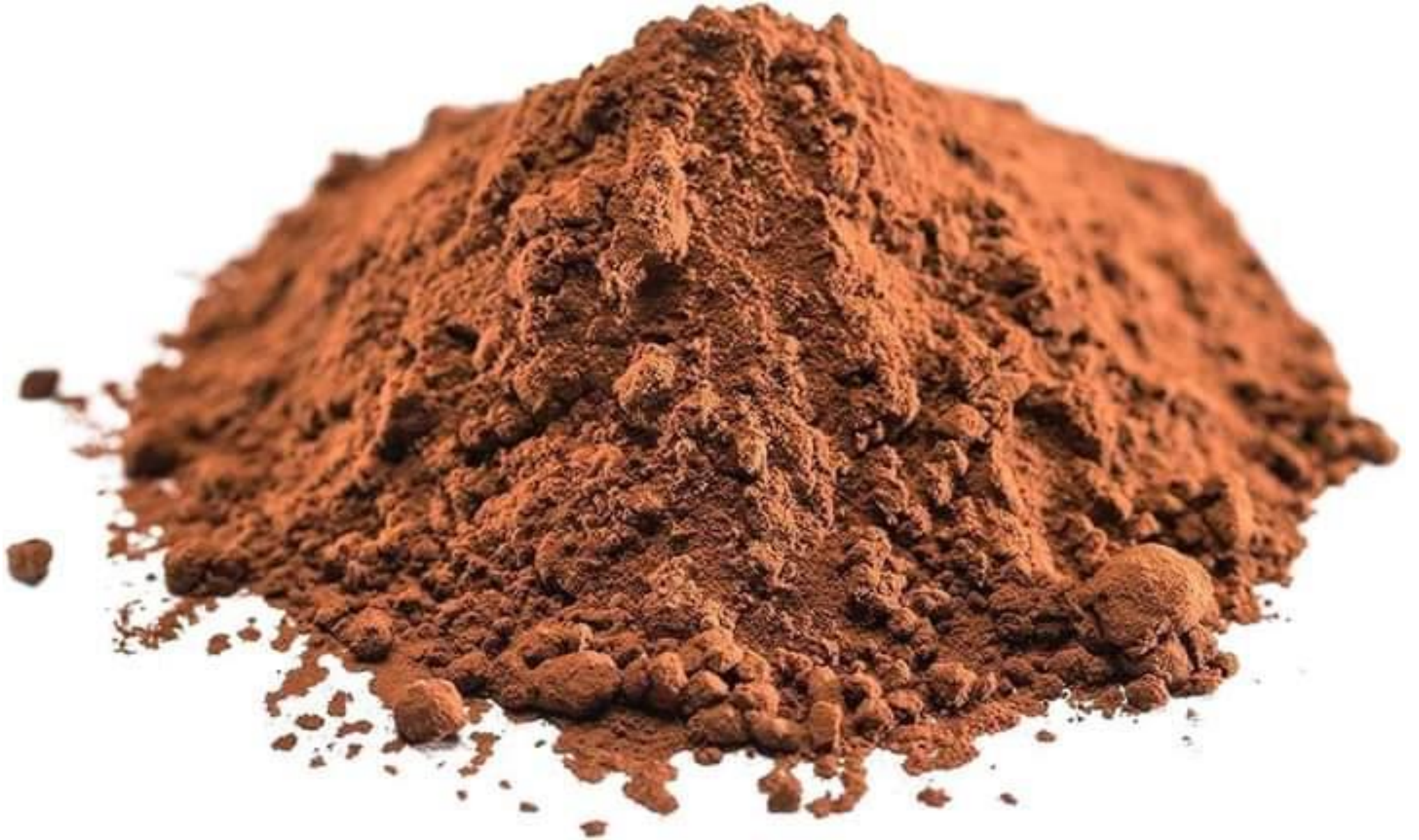
Natural cocoa powder