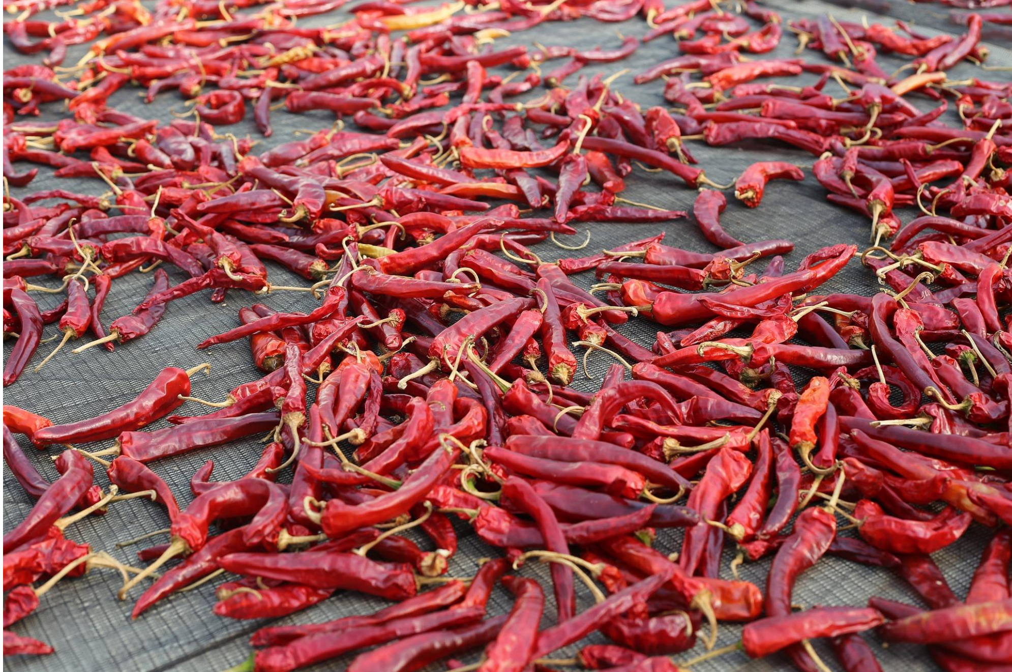
Dried chili peppers