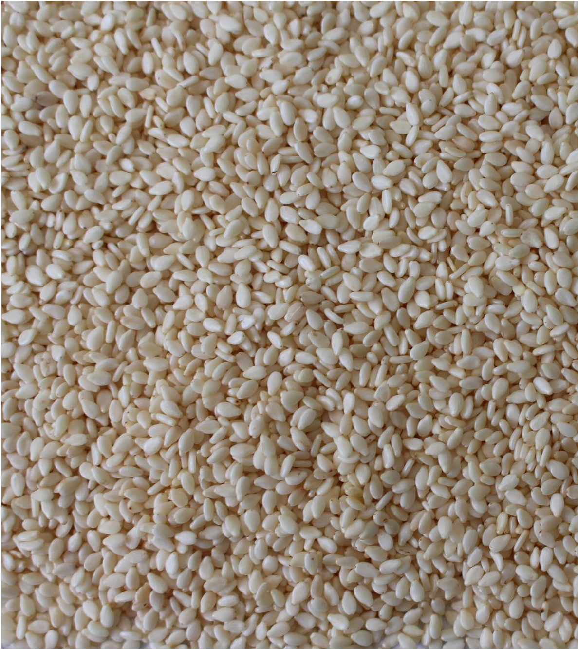
White Sesame Seeds