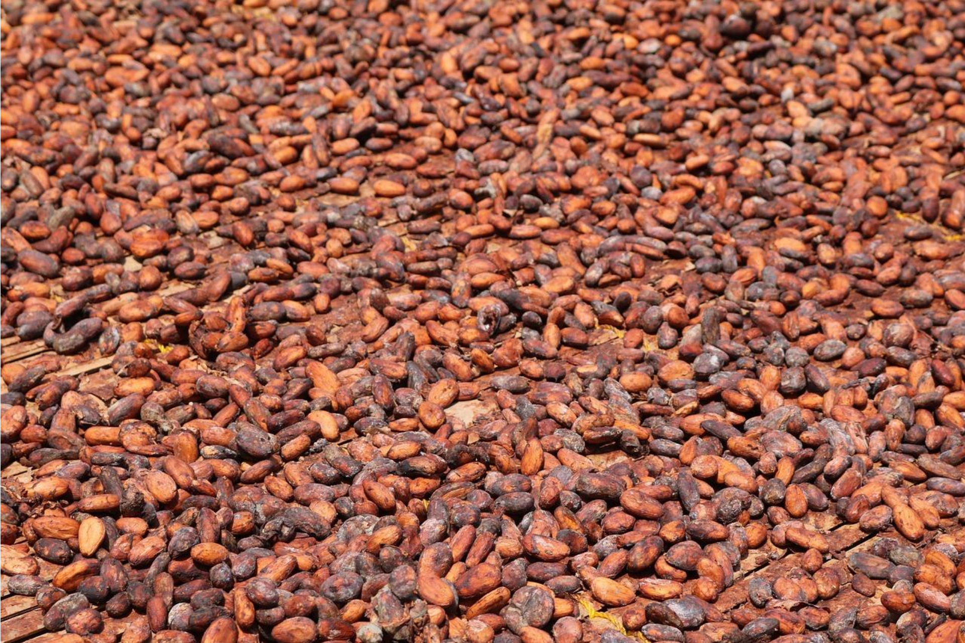
Pure & Natural Fermented Sun Dried Cocoa Bean