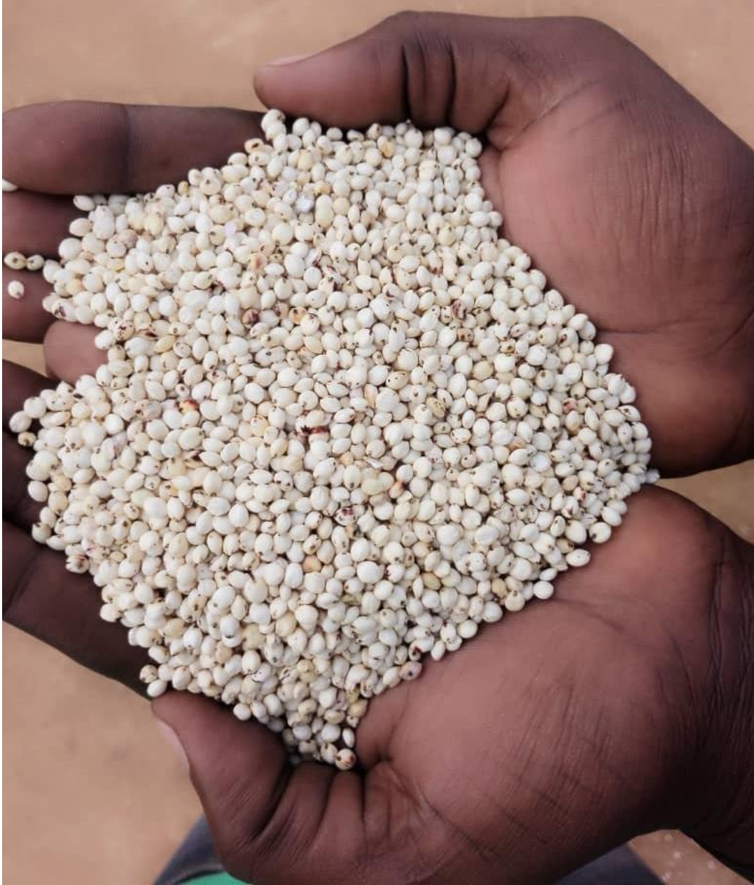
White Sorghum grains