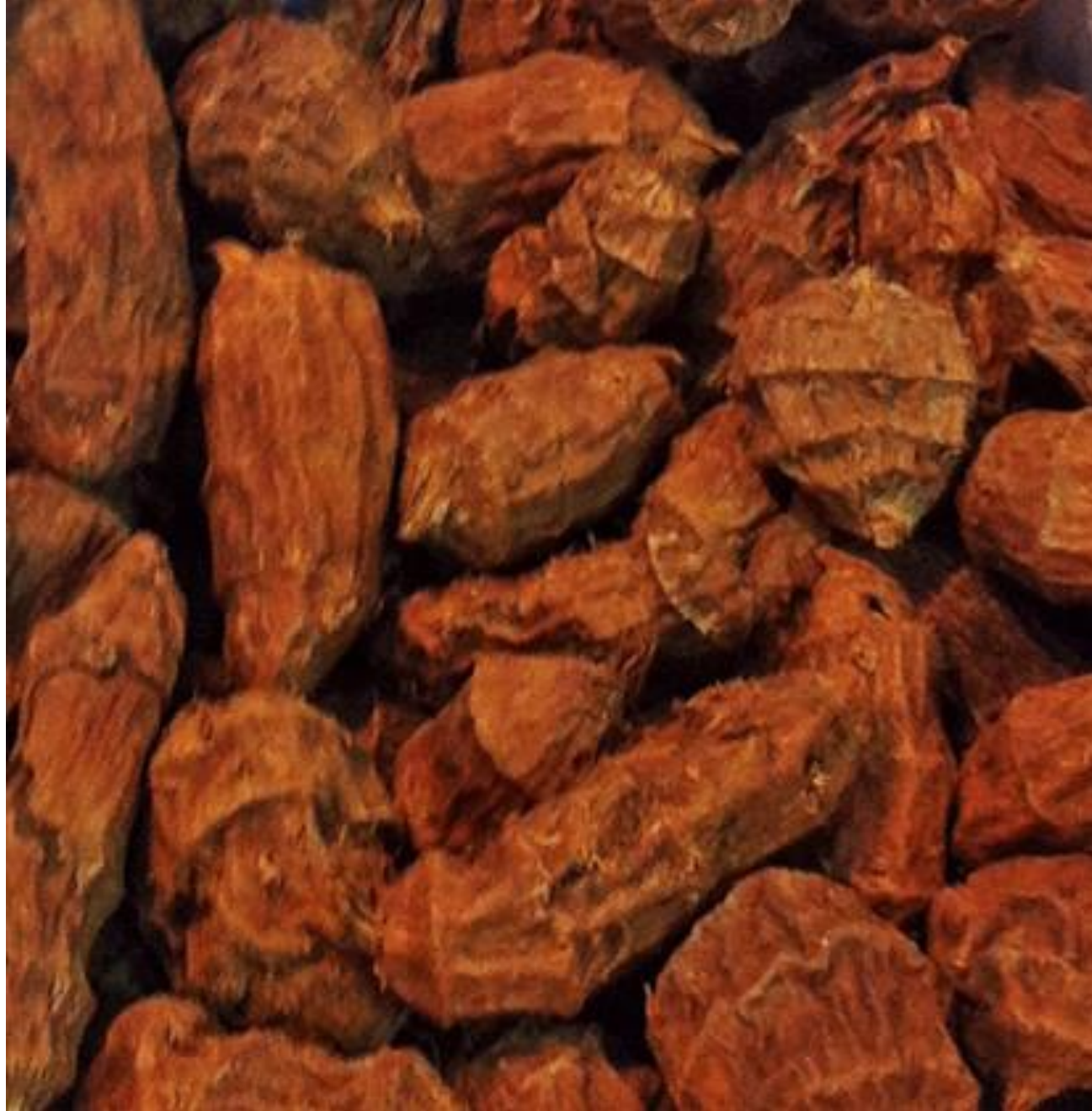
Tiger nuts (sweet peas)