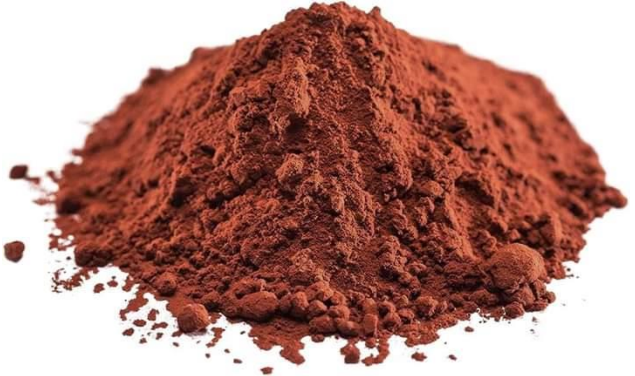
Brown alkalized cocoa powder