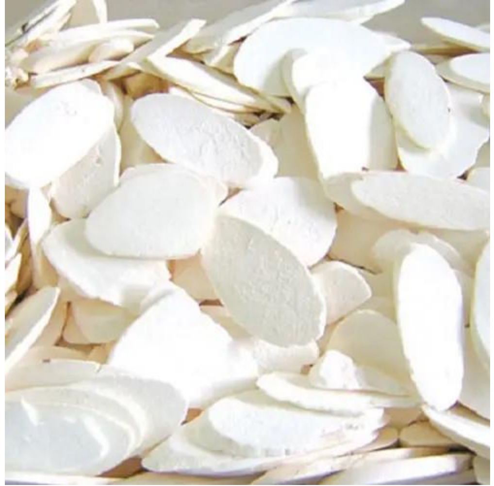
Dried cassava chips