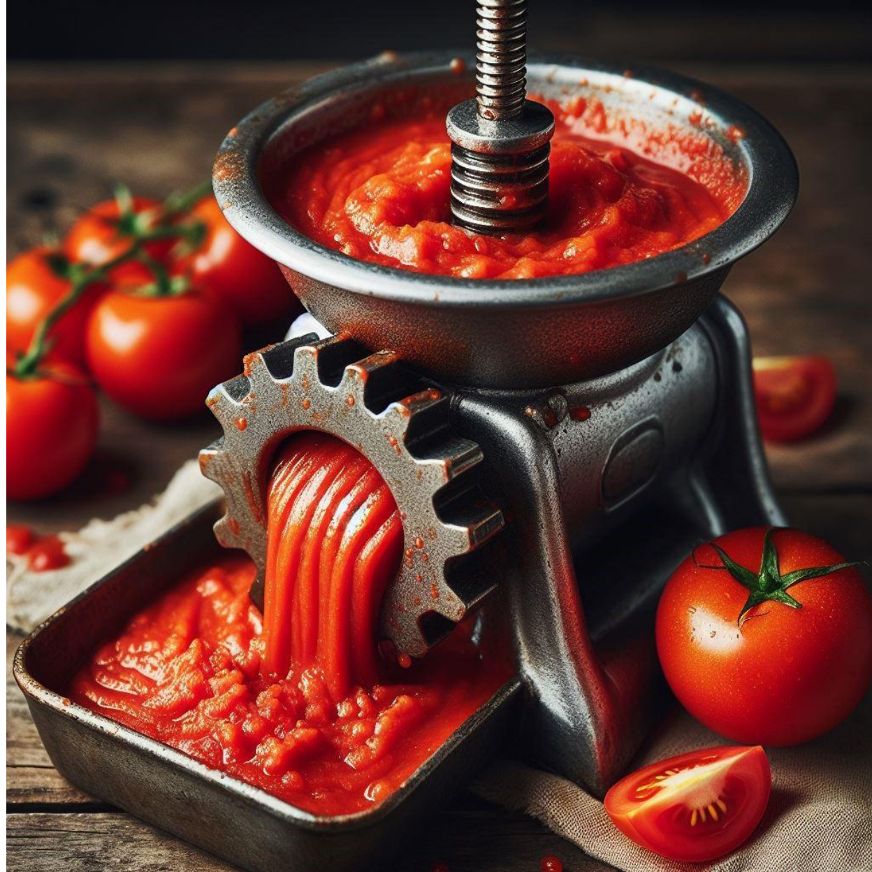
Tomato Purée For Food manufacturers