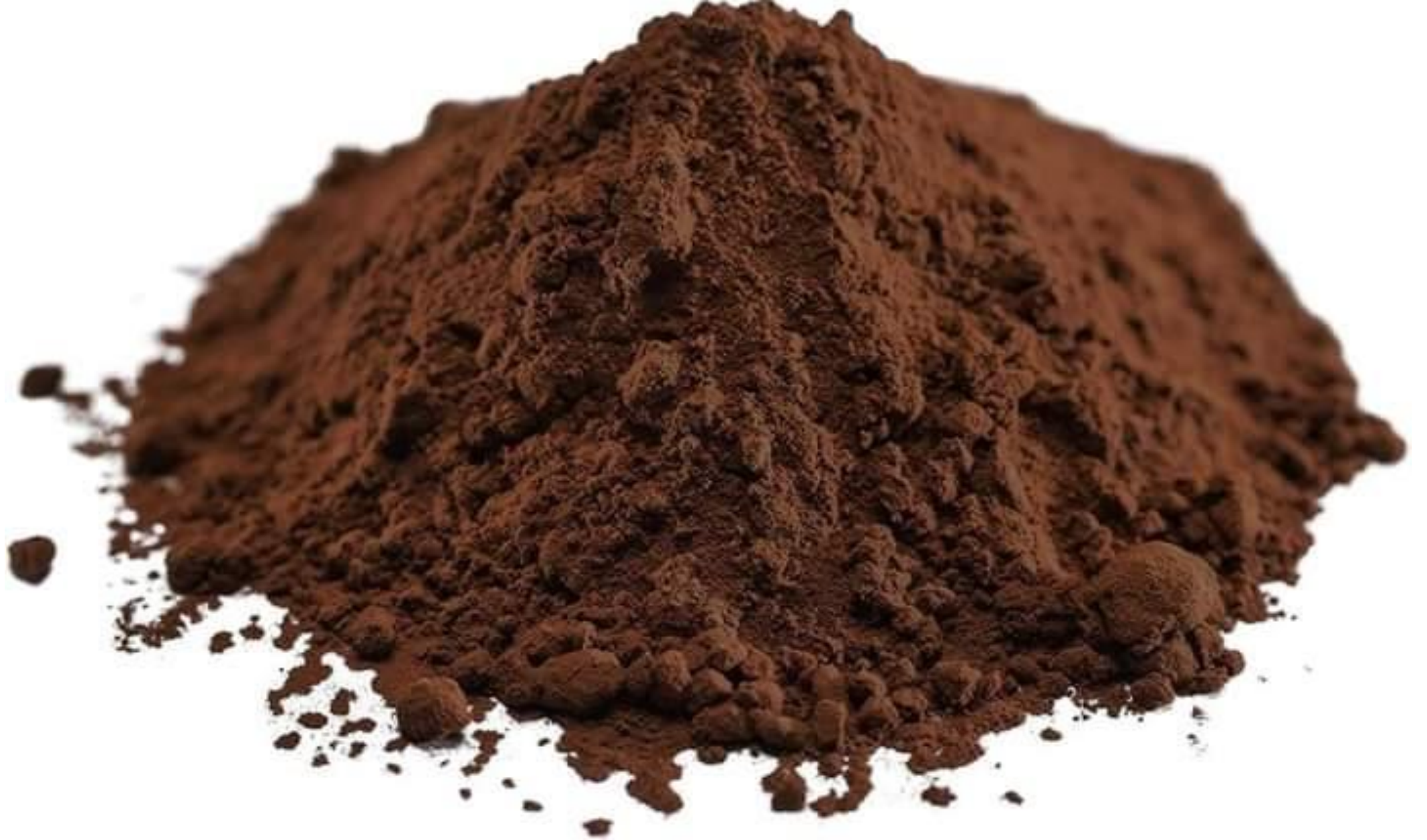
Black alkalized cocoa powder