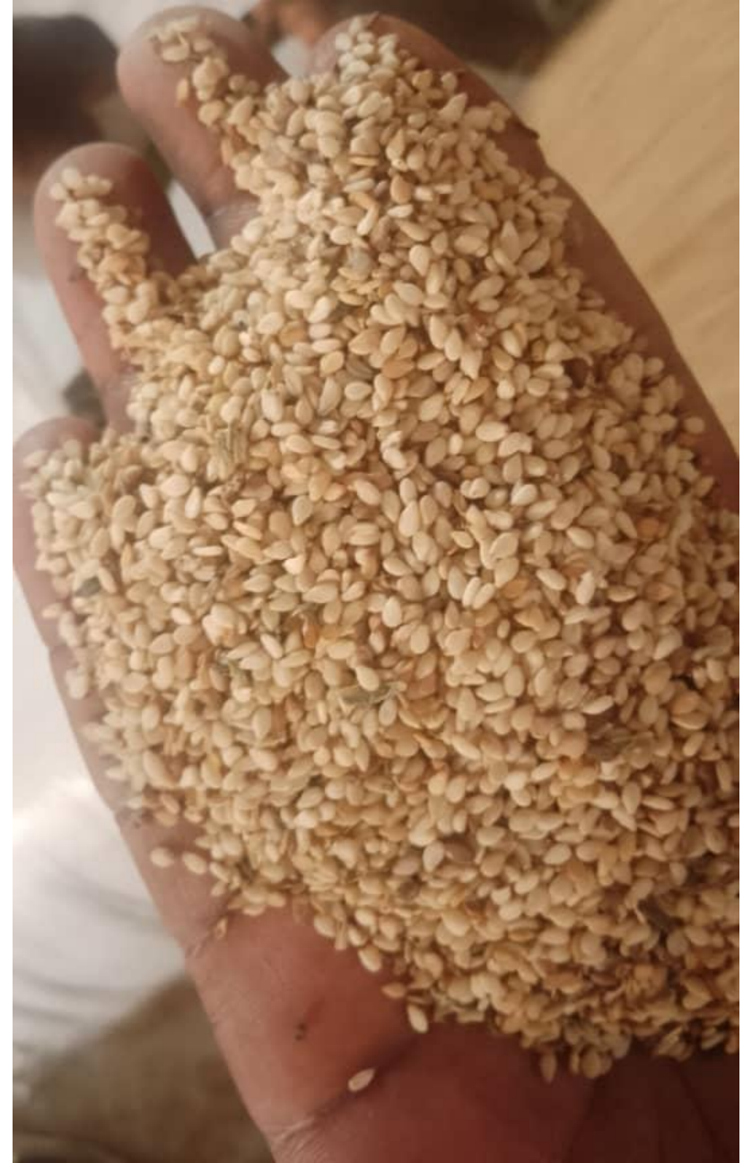
Brown Sesame Seeds