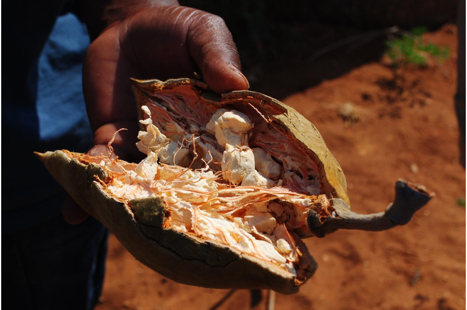
Baobab (fruit and pulp)