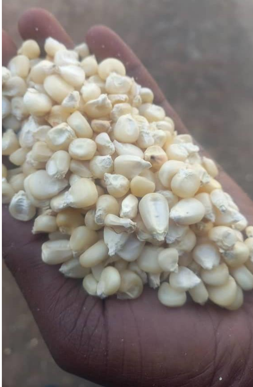
White Corn / Maize