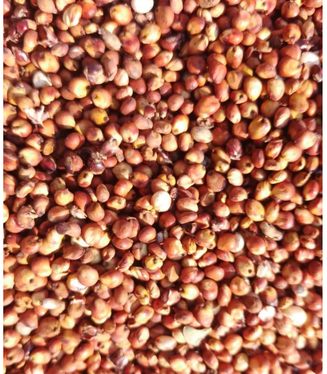
Red Sorghum grains