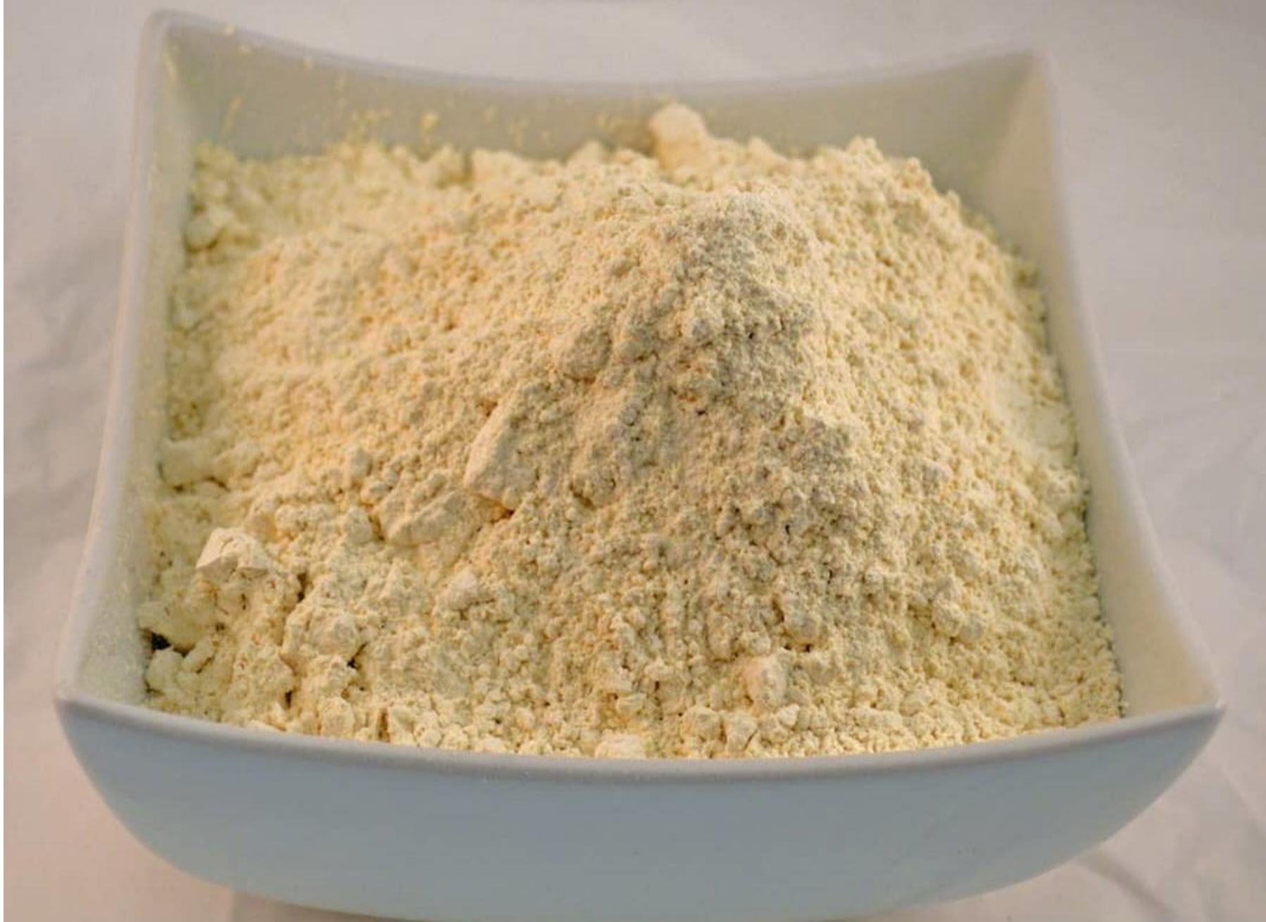
Organic Soybean Flour