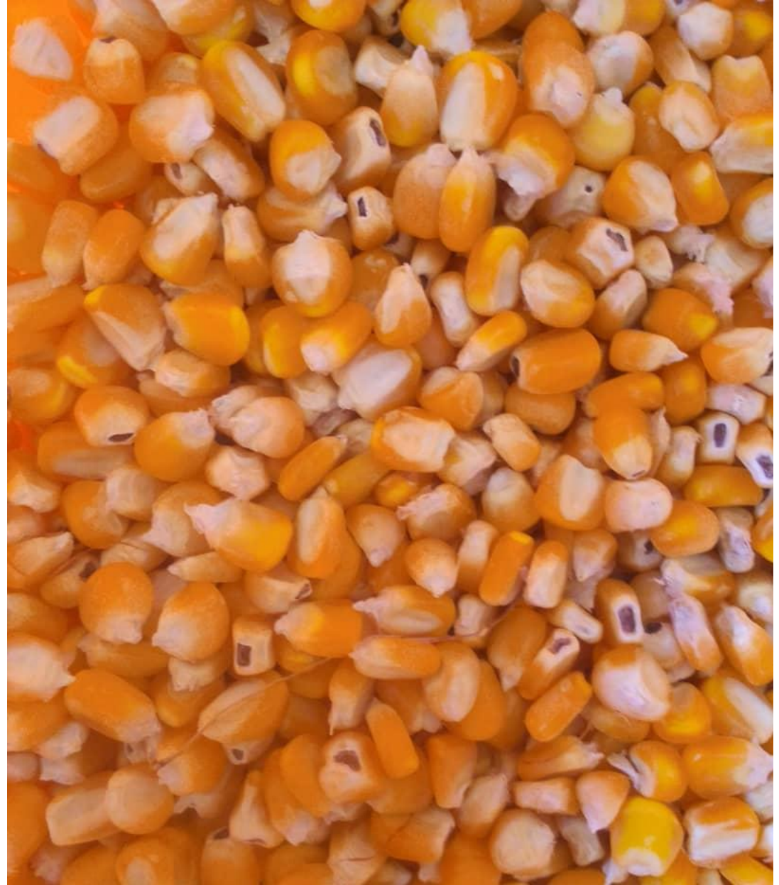
Yellow Corn / Maize