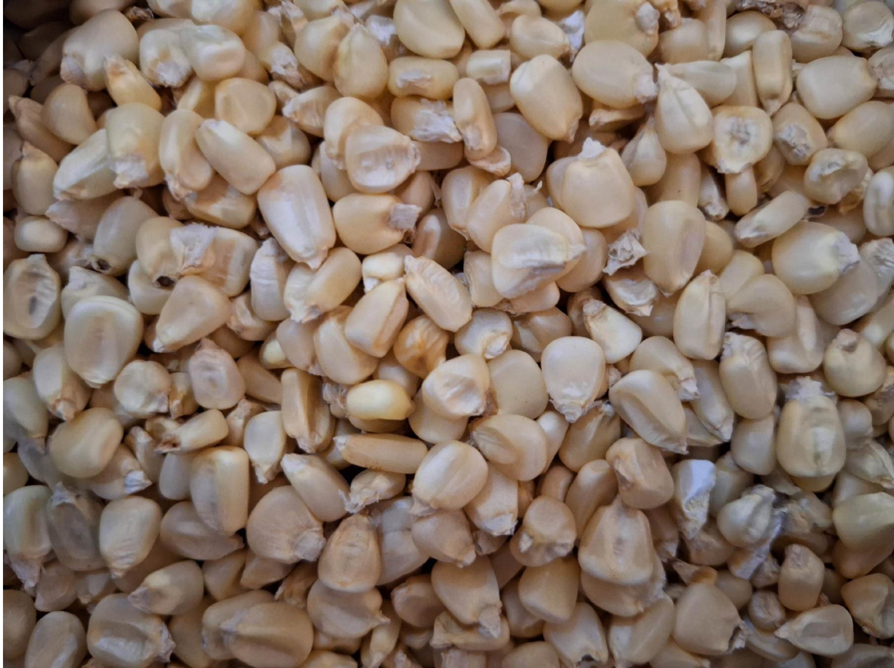
Corn / Maize