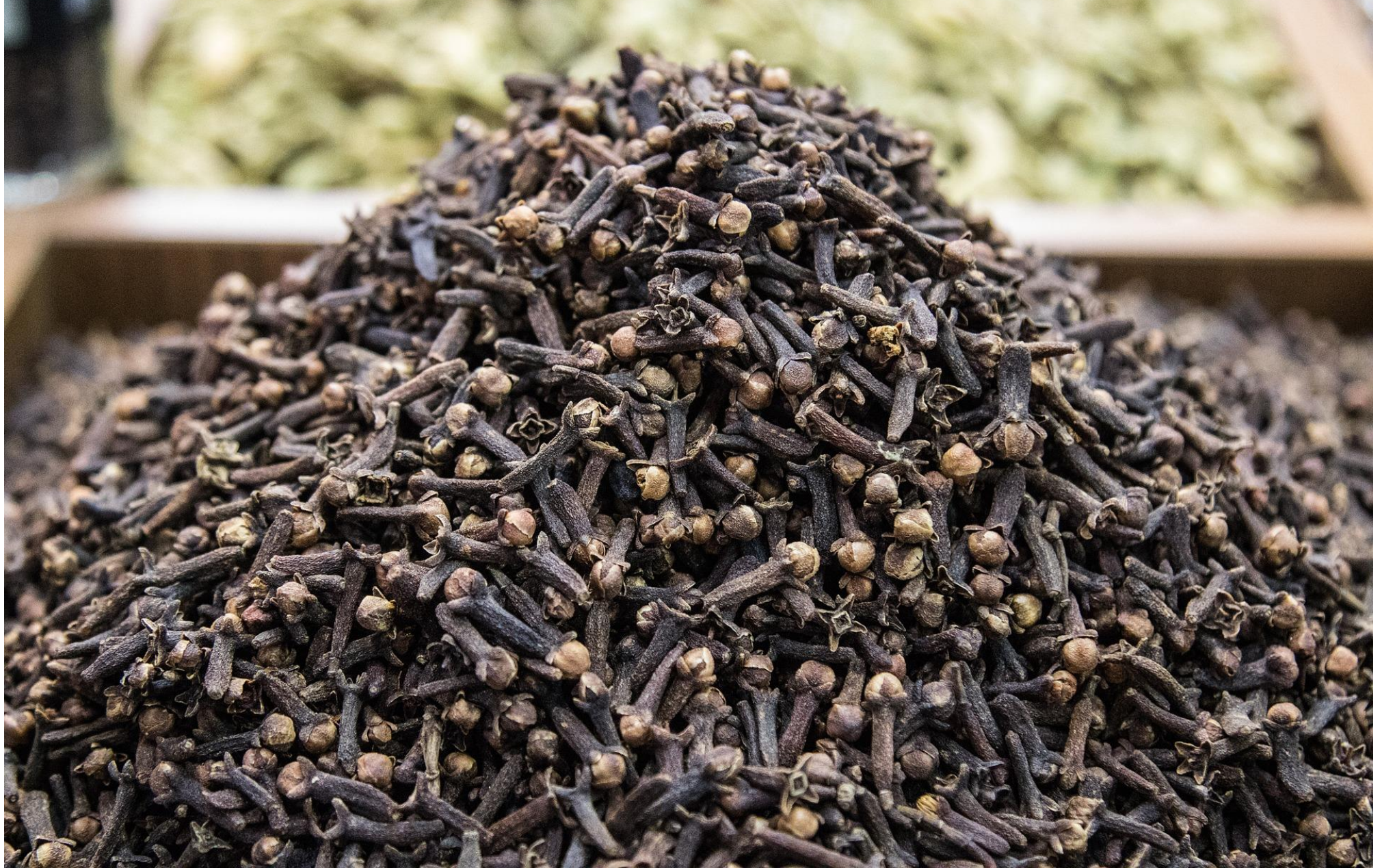
Cloves – Origin Comoros