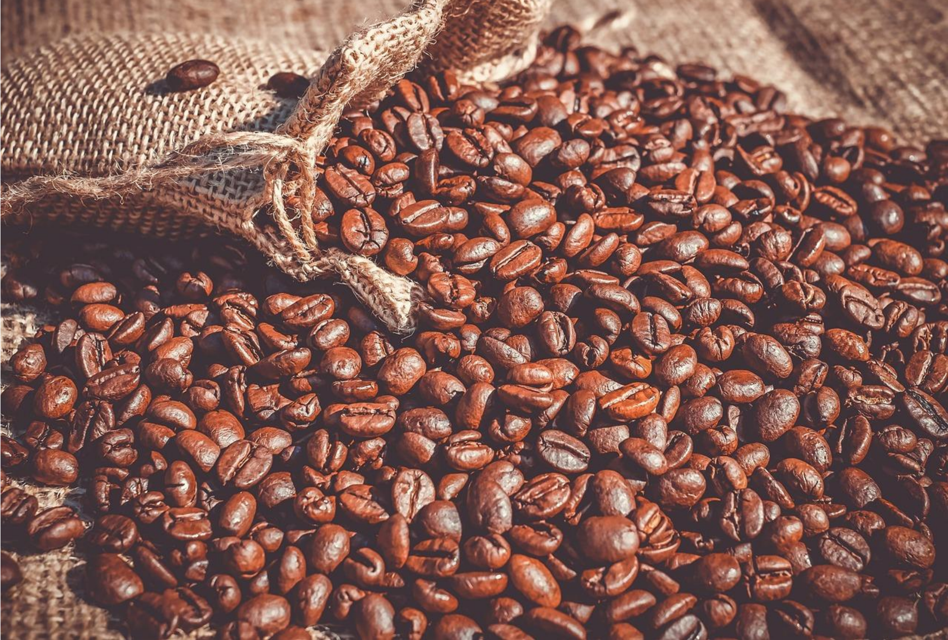
Coffee beans: Robusta, Arabica, Local varieties